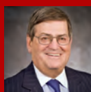
Kenneth M. Duberstein Chairman and CEO, The Duberstein Group, Inc. Director since 1998