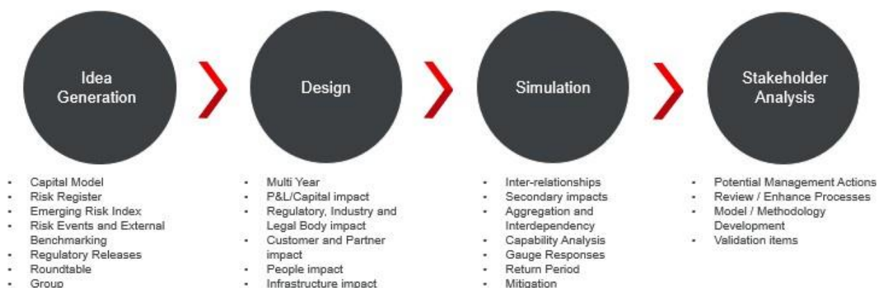
Figure A: Overview of the Stress and Scenario Methodology

Scenario testing is typically used to assess (forward-looking) the simultaneous impact of a set of events. Stress and scenario analysis maintains a close relationship with the capital model. Well-functioning scenario analysis requires a robust model and methodology to perform the analysis, at the same time, the results of Stress and Scenario testing can inform refinements to the model and/or stress and scenario methodology.