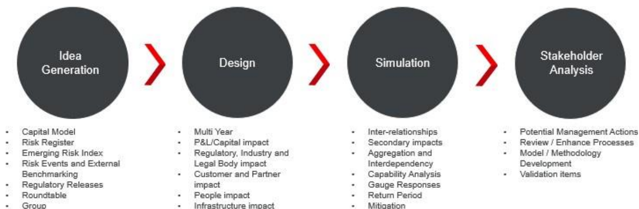
Figure A: Overview of the Stress and Scenario Methodology